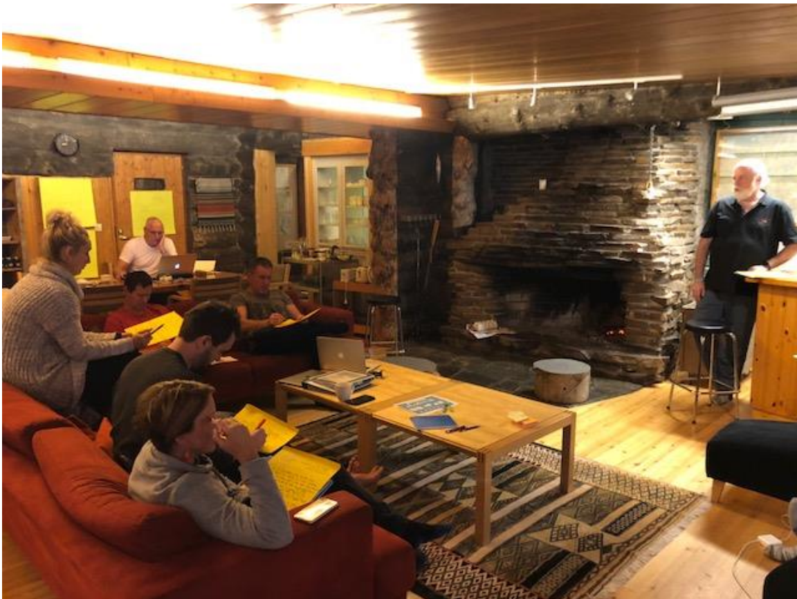
Pictured: Year 1 Recipients in Lapland